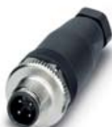
M12 Male Plug