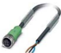
M12 Open Ended Cable