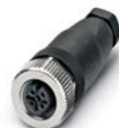
M12 Female Plug